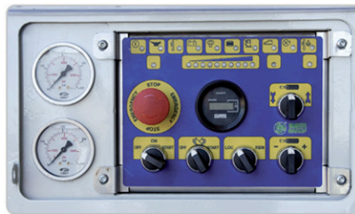
Stainless steel control panel complete with LED indicators and hydraulic gauges